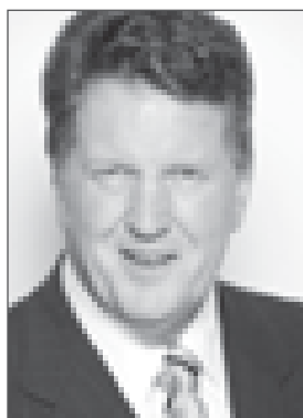
Hon Rick Barker Minister of Internal Affairs

The Fund's main emphasis is on overseas travel, enabling applicants to attend an international event or conference for the benefit of the New Zealand community or a significant sector of the community.